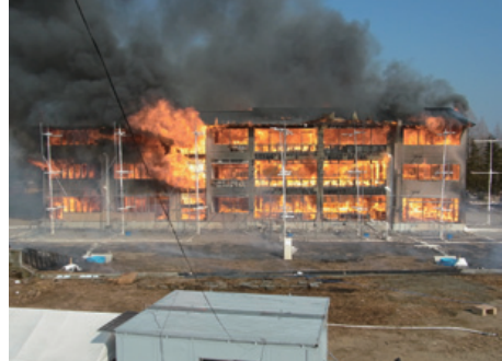
Photo 8: Three stories burning simultaneously (33 minutes after ignition)

Also note that while an inflow of light smoke was observed in the staircase after 68 minutes, as there was almost no rise in temperature, this is not regarded as an impediment to evacuation. In addition, the fire did not spread to the other side of firewalls.