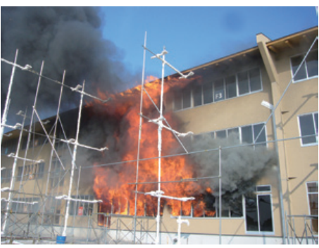
Photo 7: Fire spreading to upper floors due to emerging flames (six minutes after ignition)