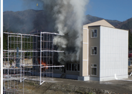
Photo 9: Flashover occurs in ignition room (89 minutes after ignition)