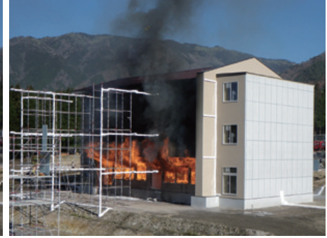
Photo 10: Flames also emerge from second floor opening (131 minutes after ignition)