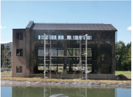
Photo 13: Fire spreads to the third floor Photo 14: After test completion (following day)

floor broke due to emerged flames from the south-side window of the room in which the fire started. This was followed by flames entering the interior from the north-side windows and the walls starting to burn, and 87 minutes later the entire interior of the floor became engulfed in flames (Photo 12).