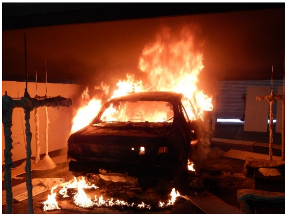
Car Fire Test