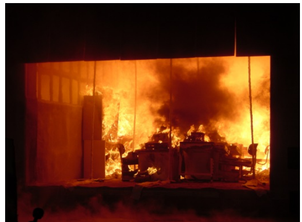
Fire Test on Office Room