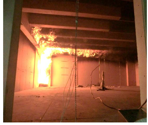
Fire Tests on building materials/products used at interior and/or exterior of buildings