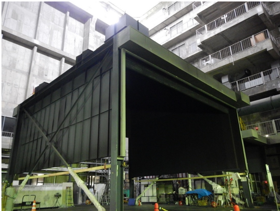
Fire test hall with smoke exhaust hood used for measuring heat, smoke and gas generated from combustion. (7 story smoke control test tower is seen at right rear.)

The laboratory consists of a burn hall with 720m 2 floor area and 27m ceiling height, observation rooms and 7 story smoke control test tower equipped with several burn rooms, two stair-wells, an air supply shaft, smoke exhaust shaft and mechanical fans.