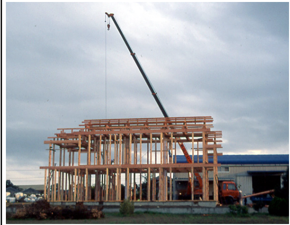
Fig. 5 Assembling members in building site