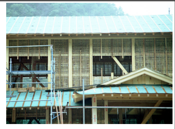
Fig. 10, Bamboo lath viewed from outside