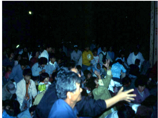
Fig. 6. Delivering rice cakes to local community after Muneageshiki

Toyohashi. On average within the last 5 years, almost 1,000 units were constructed by housing contractors using foreign timber constructions. On the other hand, local carpenters built only 400 units using traditional timber techniques., and only around 30% were clay walled house because they did not always use clay walling. Anyhow, it is very exceptional that 10% of detached house built annually is of clay walled type if compared to whole country.