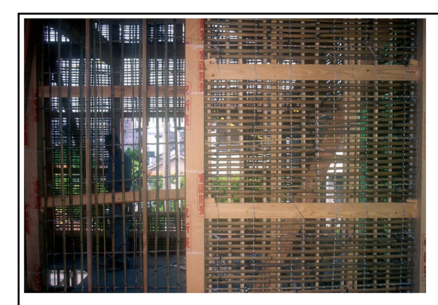
Fig. 9, Bamboo lath viewed from inside

In rural area, lath work, clay walling and thatch roofing were traditionally performed by <u>Kumi</u> or <u>Yui</u>, a mutual aid of local community, as farmers used to do such jobs and quality of works did not matter. Thus, previously the house building was started just after the paddy harvesting in October, and <u>Arakabe</u> was applied before the advent of winter, preferably in