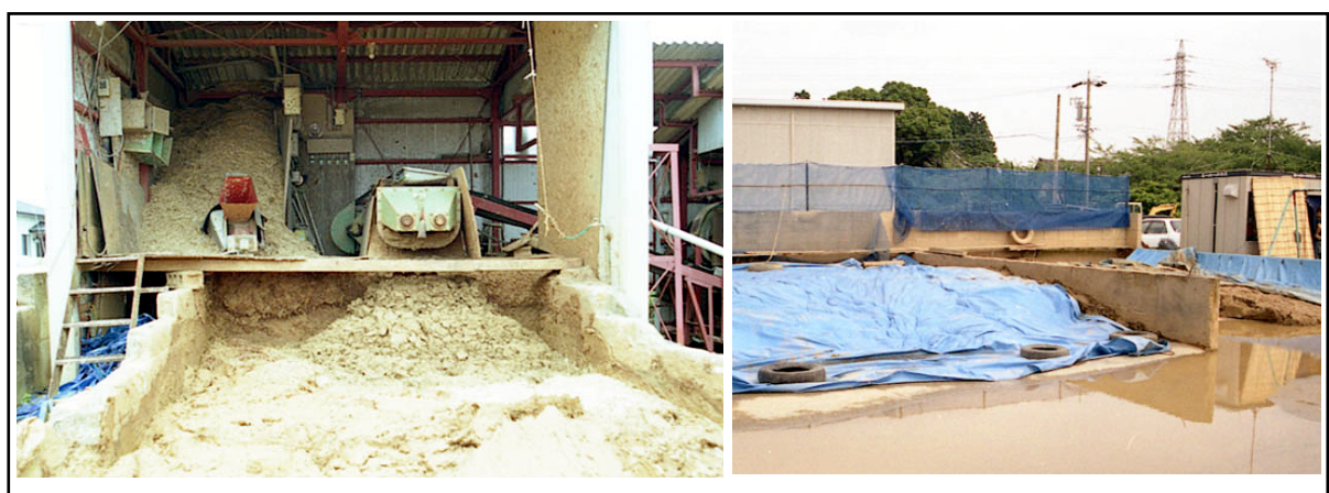
Fig. 7, Dorokon Plant in Toyohashi

The clients usually look for a Toryo , a master carpenter for new house among local community through relatives and friends. <u>Toryo</u> takes all responsibility and seizes the initiative for building the house, sometime even preparing house plan in collaboration with client without hiring an architect. Carpenters put sills on the concrete foundation, and erect